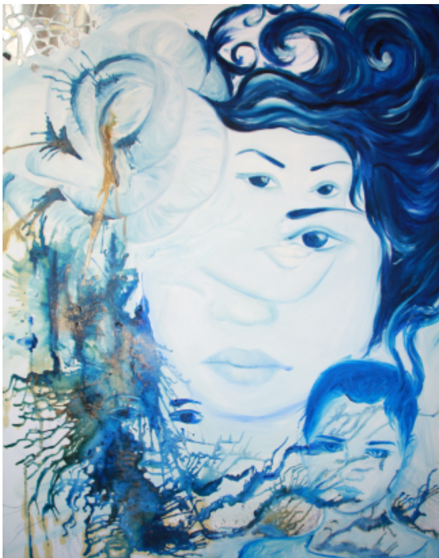
Recherches / Research (Huile, spray et miroir sur toile) 65 x 81 cm 2015