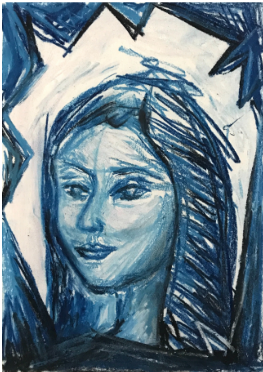
Un sourire face à l'adversité / A smile in the face of adversity (Pastel sec) 21 x 29 cm 2020