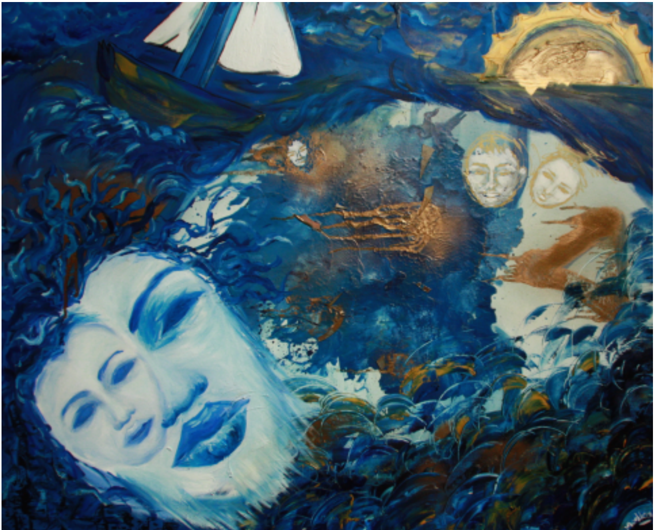
Le visage de Méduse / Medusa's face (Huile et spray sur toile) 100 X 80 cm 2015