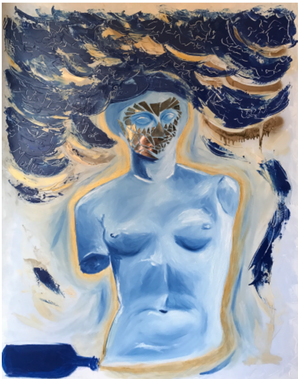
Les yeux sont le miroir de l'âme / Eyes are the soul's mirror (Huile, spray et miroir sur toile) 80 x 100 cm 2017

The search for answers here goes through expressive portraits, absolutely unrealistic and intriguing aquatic compositions. All of this is tinged with the melancholy of passing time, as well as our helplessness in the face of it and the events of life.