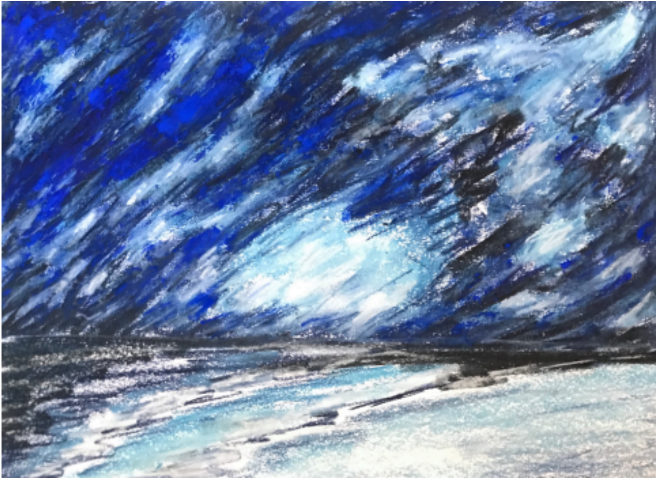
La lueur / Glimmer (Pastel sec) 29 x 21 cm 2020

A message of hope thrown into the sea for us to have faith in our path.