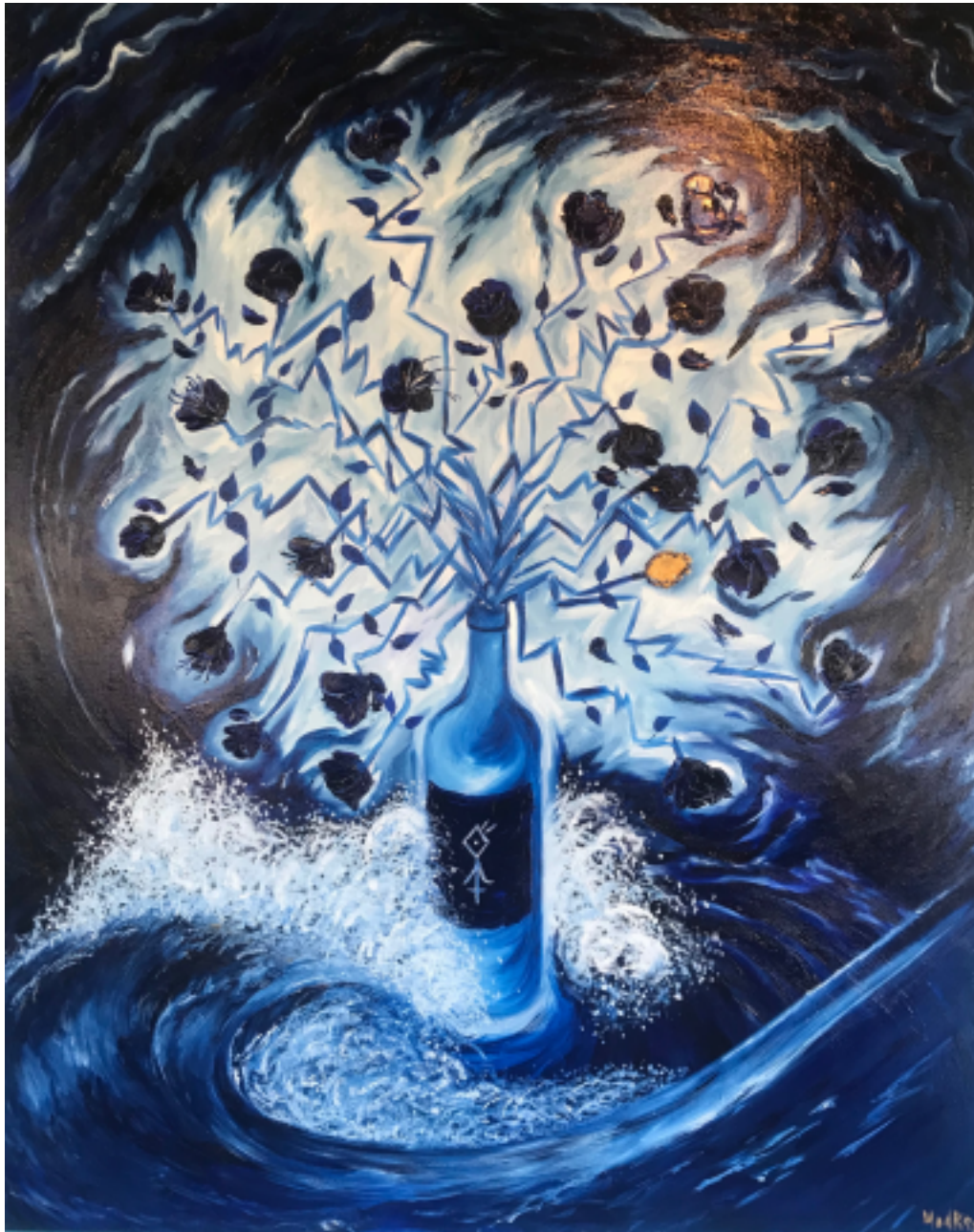
Que les vagues vous emportent / Waves take them with you (Huile sur toile) 80 x 100 cm 2020