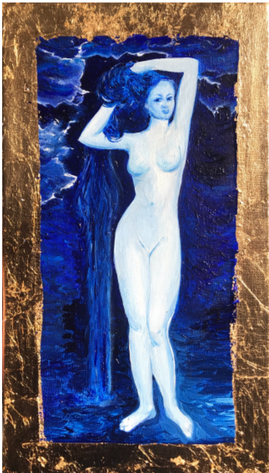
La naissance de Vénus d'après Amaury-Duval / Venus's birth from Amaury-Duval